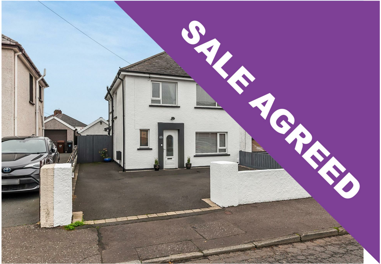
15 Burneys Lane, Newtownabbey, BT36 7AB